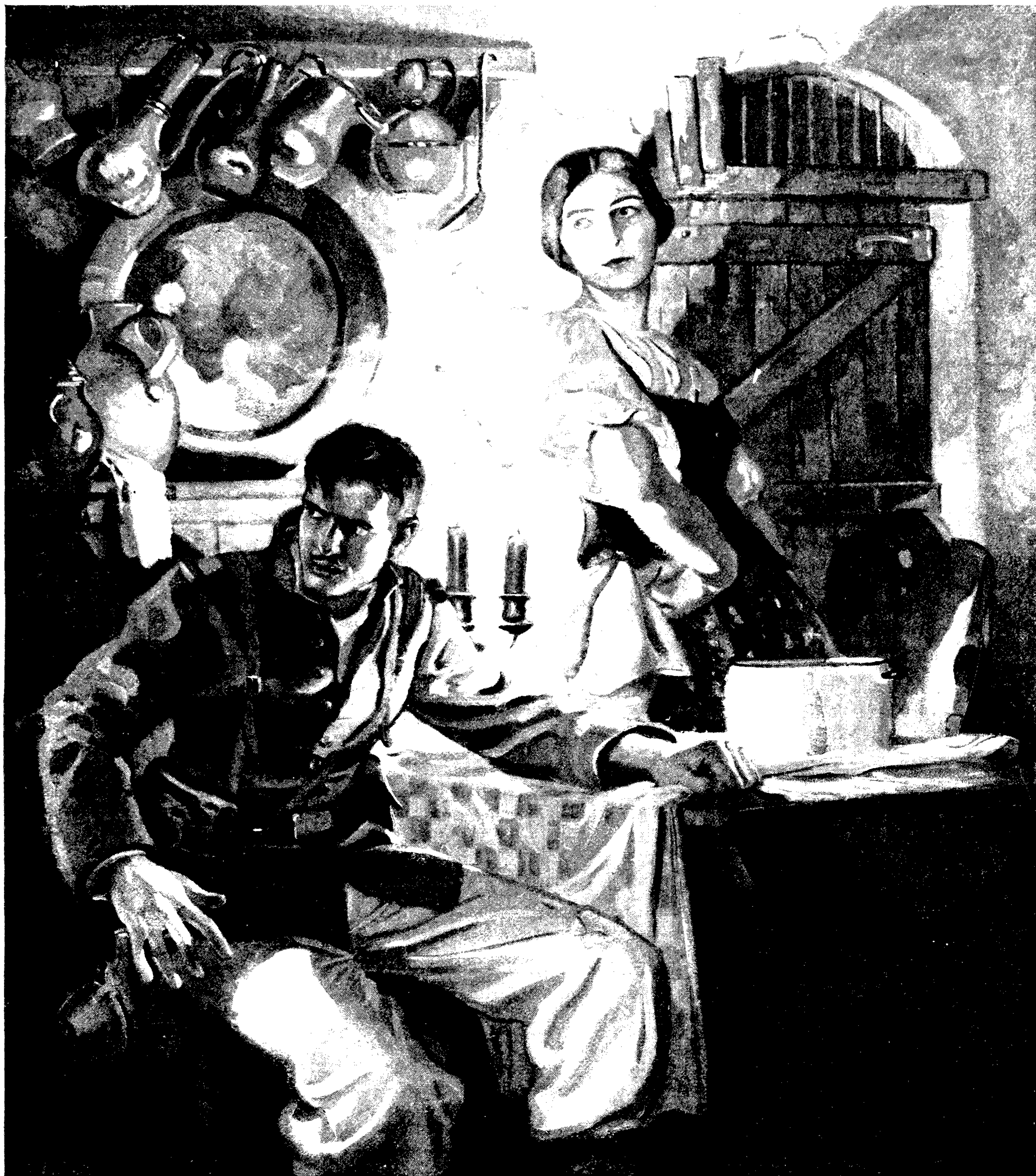
A series of loud strangling groans from an adjacent room whose door stood ajar startled him into action

"What is that?" he cried, half afraid that he was being trapped.