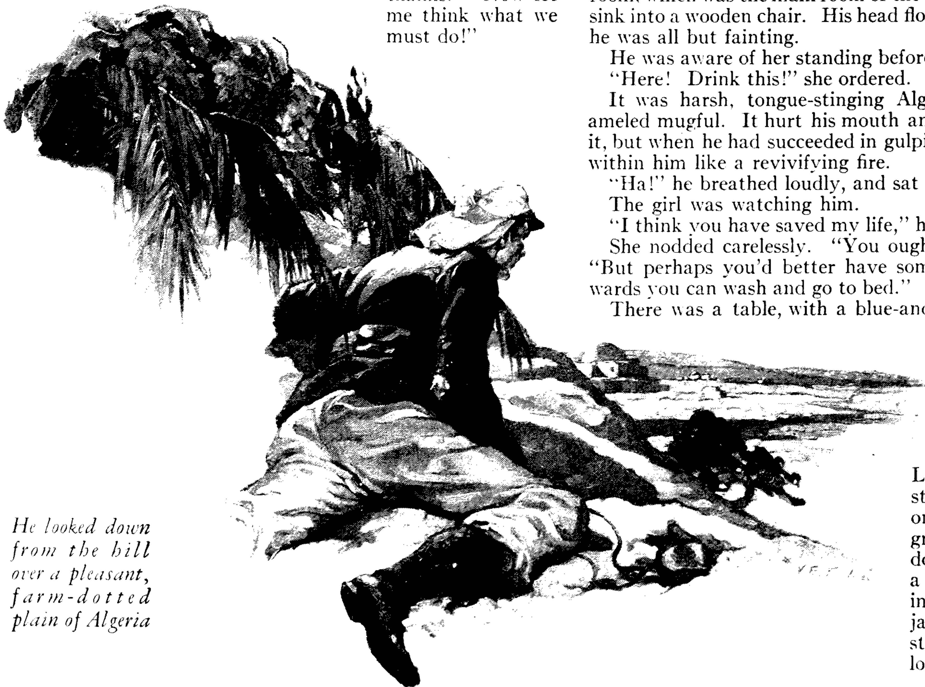
He looked down from the hill over a pleasant, farm-dotted plain of Algeria

would have frothed into a hysteria of thanks. "Now let me think what we must do!"